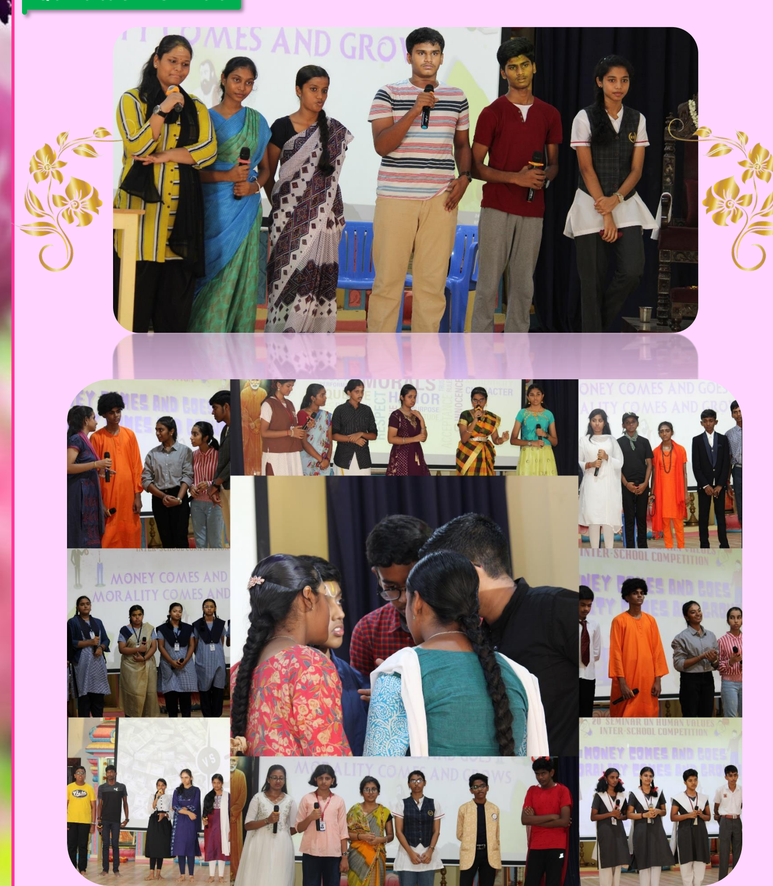
Q & A Session Glimpses