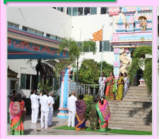
Prasanthi Flag Hoisting