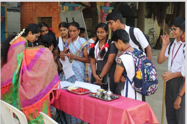
Reception & Registration