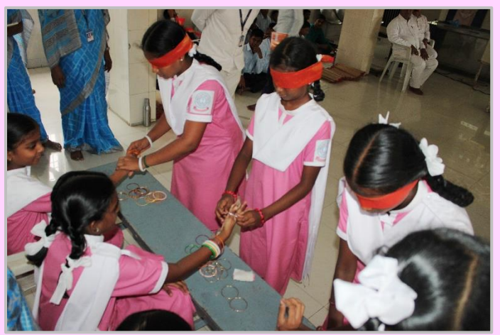
Glimpses of the Value Games event