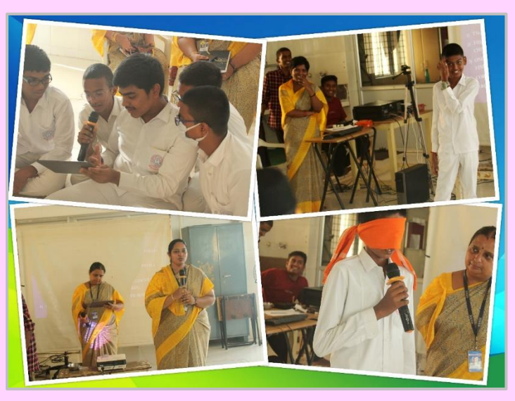
Glimpses of the Quiz Contest Bharatheeya Sanskrithi