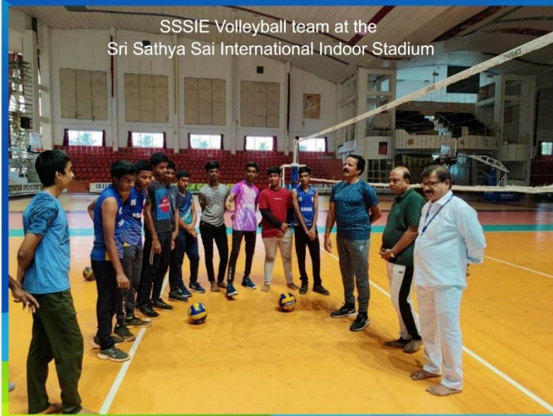
SSSIE Volleyball team at the Sri Sathya Sai International Indoor Stadium