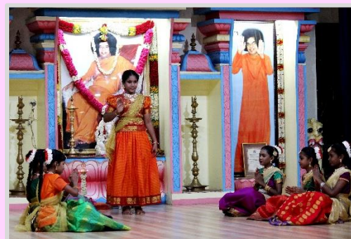
Glimpse of the cultural programmes offered by the students