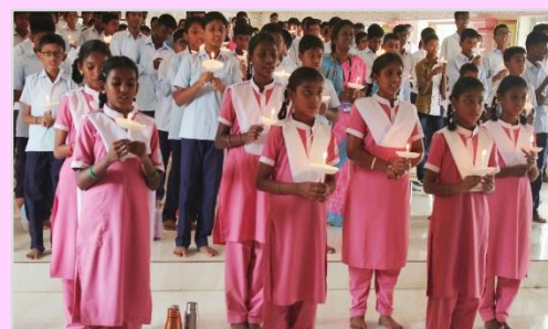
Summer course oath