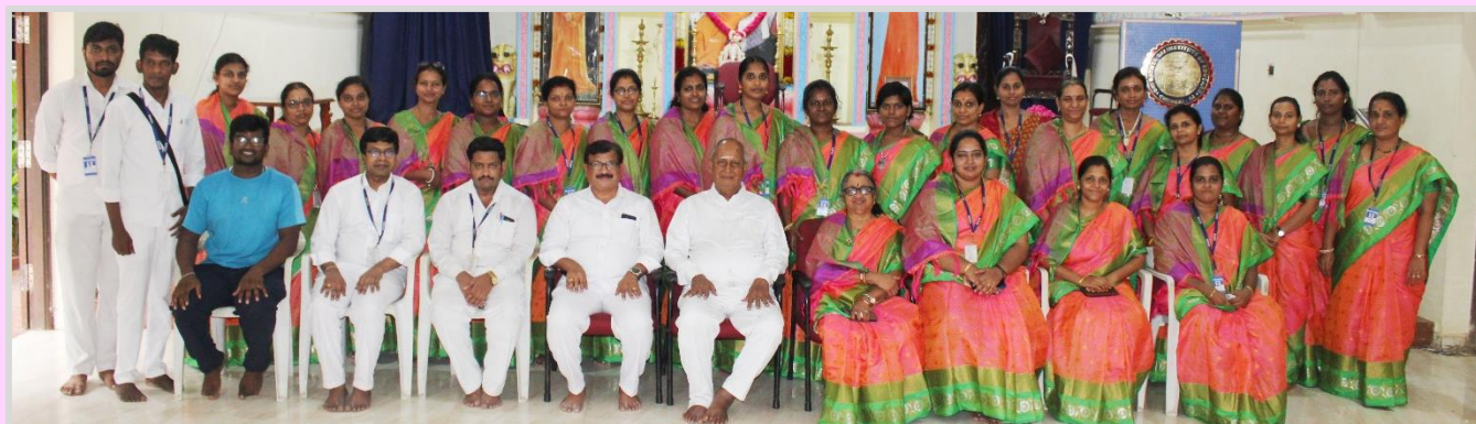
Gurus posing together after the meeting