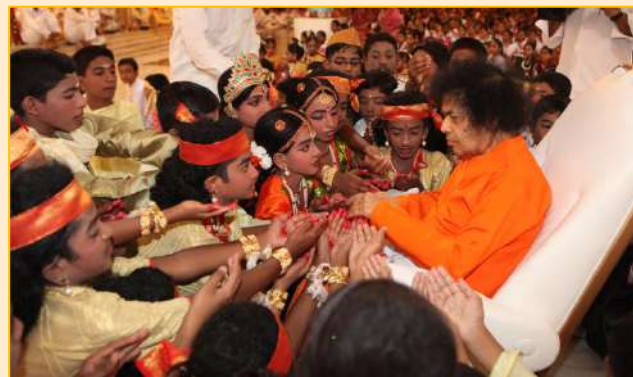
Sai Vidya Sarasa Vidya - All India Sai Schools Drama in the Divine presence