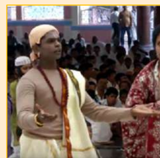
Bharath Dig Vijayam - SSSVV rally drama - scene depicting the glory of Indian Poets