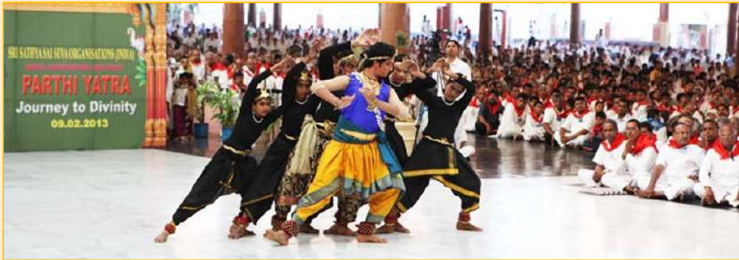
'Kalinga Nardhanam' dance performance in the Divine presence

During the Kancheepuram Parthi Yathra, SSSIE students performed 'Kalinga Nardhanam' dance in the Divine presence on 9 th Feb 2013.