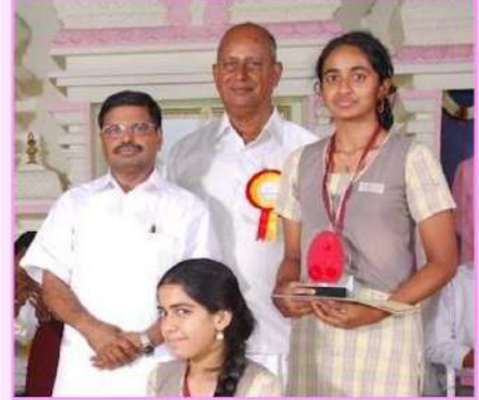
Hon'ble Justice Sri D.Hari Paranthaman (Madras High Court)