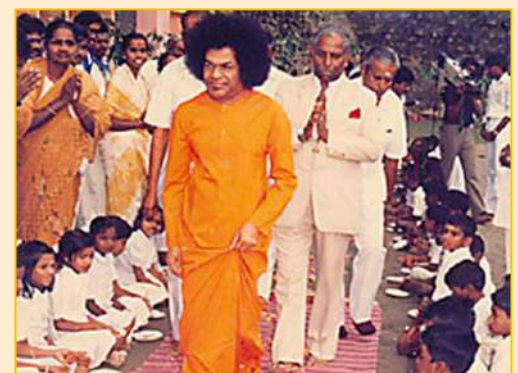
SSSIE Students welcoming Bhagawan with flowers on the foot path

In the year 1984, Swami visited an eye camp held in Chromepet. During that time, our school students were blessed with an opportunity to receive Swami by offering flowers on the footpath from entrance to stage.