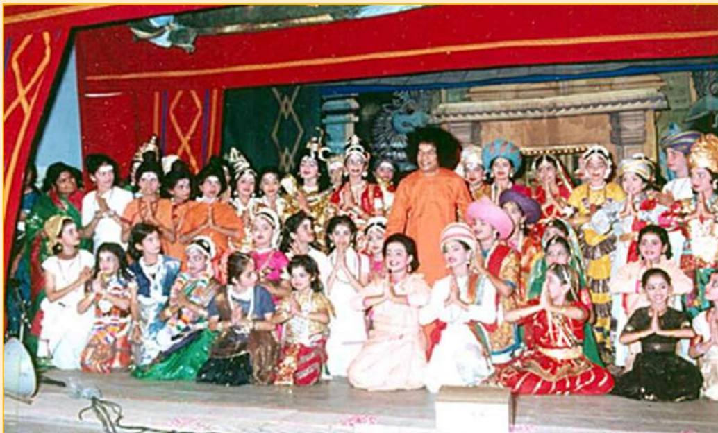
Swami posing with the Gnaneshwar Drama Characters at Purnachandra Auditorium