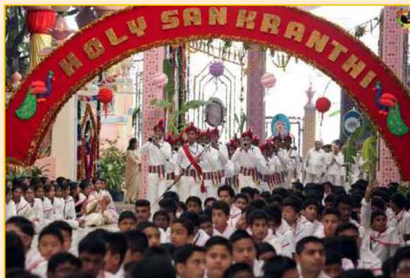
SSSIE Band Team in the Divine Presence

SSSIE band students got a golden chance to perform in the Divine presence during the all India Balvikas Alumni Meet held from 17 th to 19 th Jan 2016.