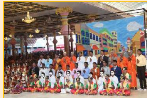
'Sarva Gnanam Mayi Vidyate' Drama in the Divine presence