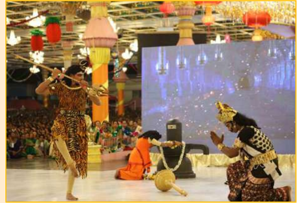
'Rudra Tatvam Ekatvam' - drama in the Divine presence