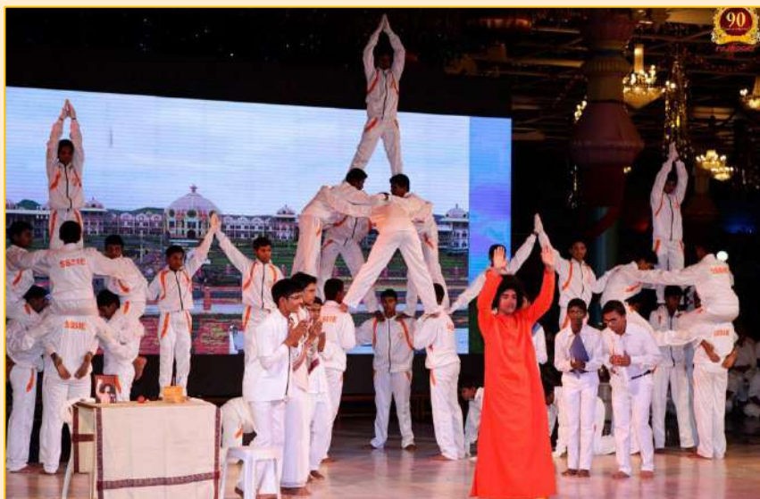
Pyramid show in Sai Kulwant hall depicting the Sri Sathya Sai Super Specialty hospital, Puttaparthi

Bhagawan blessed the students with one more golden opportunity of participating in the All India Balvikas dance drama entitled 'SATHYA SAI SATHCHARITRA' on 18th Nov 2015. They performed a beautiful Pyramid show depicting the super specialty hospital building. The history of development of the hospital was enacted by the students during the show.