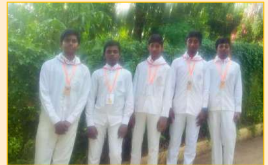
All India Balvikas Alumni Meet

Students undergo 9 years of Balvikas training along with their study. Every year, students who completed the course, are blessed with an opportunity to participate in the All India Balvikas Alumni Meet in the Divine presence and receive the prestigious Group III Balvikas certificate.