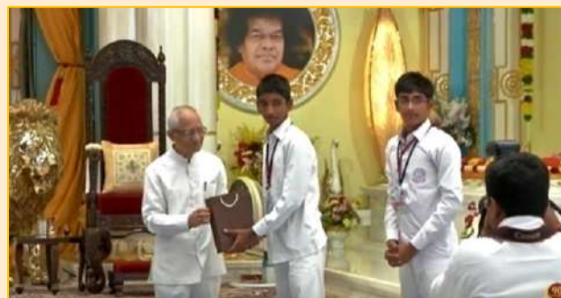
Students receiving gifts for assisting in creation of the best asset of SSSVV