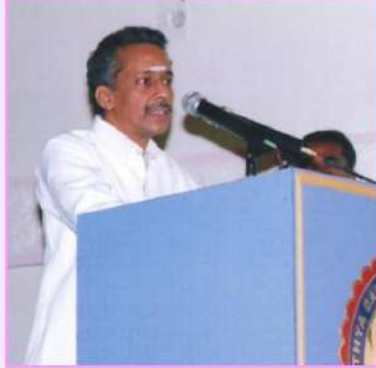
Hon'ble Justice Sri V.Rama Subramniam (Madras High Court)