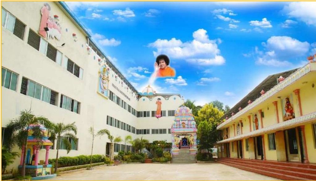
Sri Sathya Sai Balagurukulam evolved as Sri Sathya Sai Institute of Educare

After four years, the school committee switched over to the national academic curriculum, known as the CBSE (Central Board of Secondary Education) syllabus to give its students the advantage of being on par with the best in India. When it did this, it also changed its name to Sri Sathya Sai Institute of Educare as Bhagavan Baba always emphasizes on 'Educare' than education.