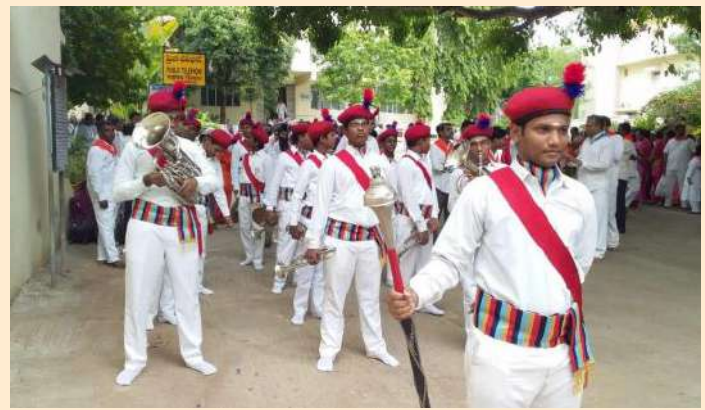
Disaster Management Drama and Band Team Performance at Parthi