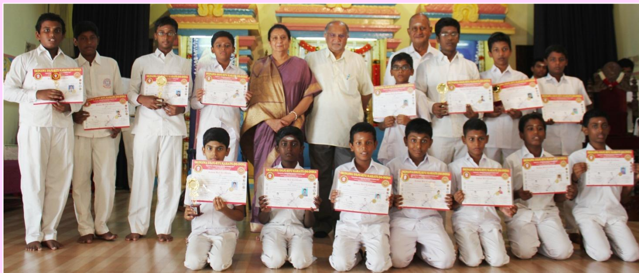
STUDENTS WHO RECEIVED KARATE GRADE BELTS