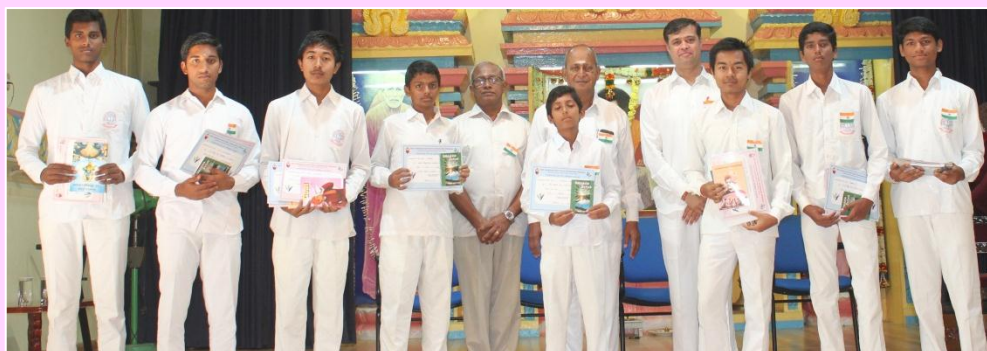
‘ALFEST’ INTER-SCHOOL COMPETITION WINNERS