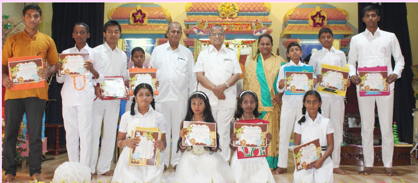
KARUNA CLUB INTER-SCHOOL COMPETITION WINNERS