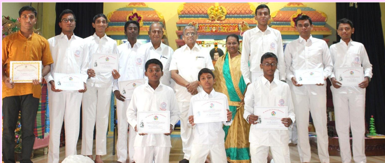
PARTICIPANTS OF THE SAI PANCHARATHNA KRITHI RENDITION