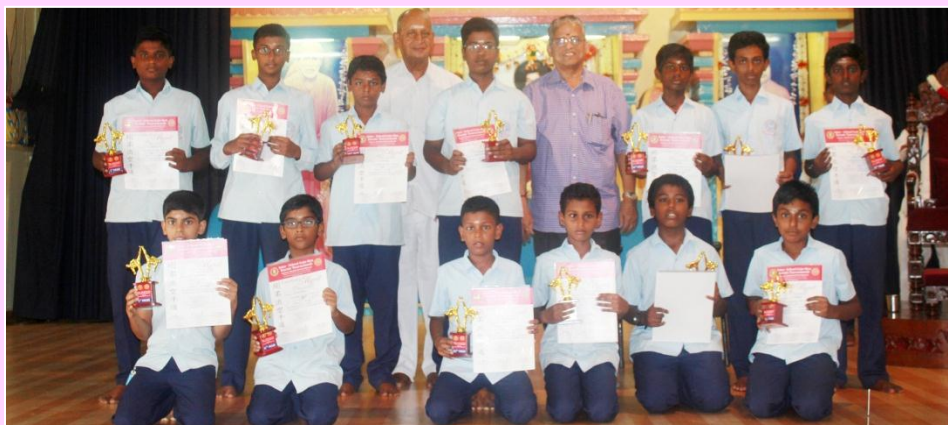
DISTRICT LEVEL GOJU-RYU KARATE TOURNAMENT