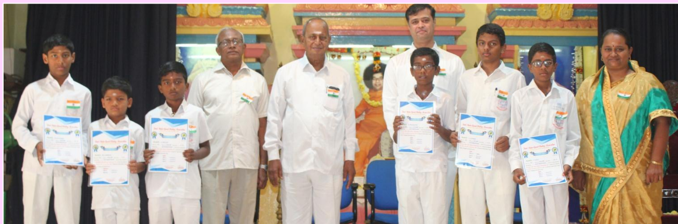
STATE LEVEL SPEED SKATING TOURNAMENT