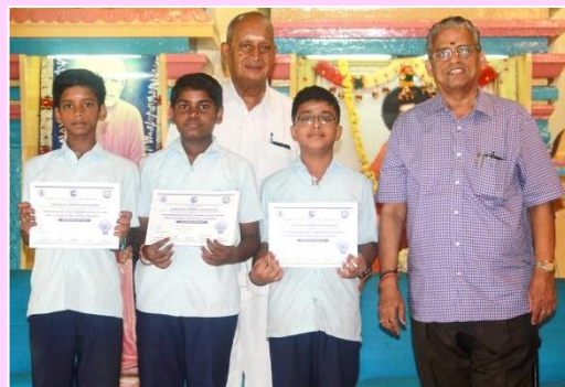
STATE LEVEL CARROM CHAMPIONSHIP