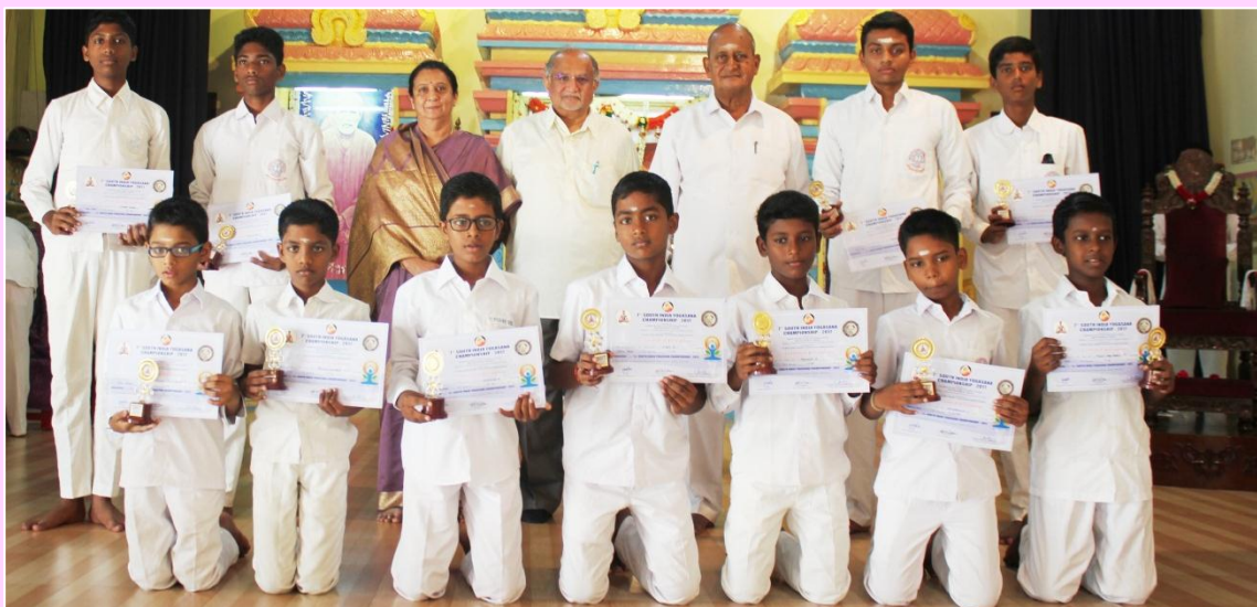
7 TH SOUTH INDIA YOGASANA CHAMPIONSHIP