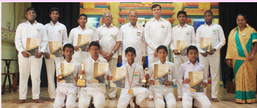
FELICITATION TO BEST STUDENTS IN SKATING