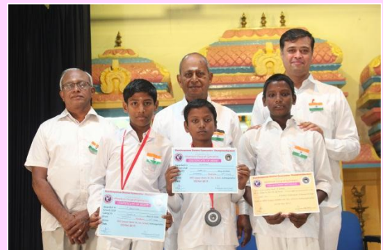
DISTRICT LEVEL GYMNASTICS CHAMPIONSHIP WINNERS