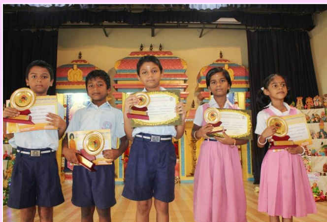
PARTICIPANTS OF THE DISTRICT LEVEL BALVIKAS TALENT SEARCH