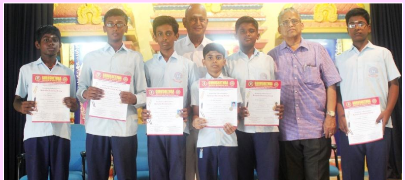
STUDENTS WHO ATTENDED KUBUDO TRAINING