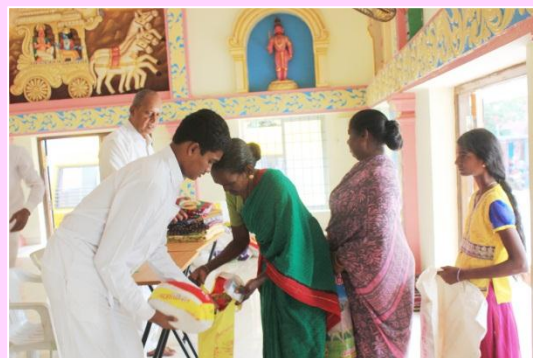
RICE DISTRIBUTION SEVA