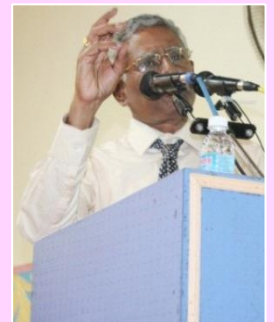
2 ND SEMINAR ON VALUE-BASED EDUCATIONAL GOVERNANCE