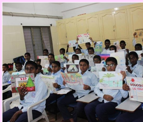
VIDEO CONFERENCING IN PROGRESS WITH PARTNER SCHOOL IN USA