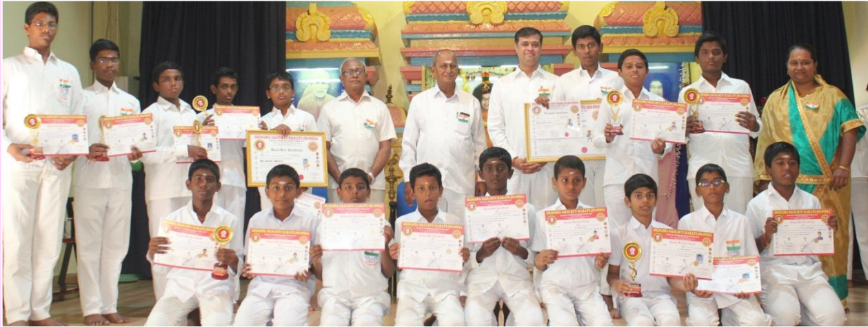
STUDENTS WHO COMPLETED KARATE BELT GRADING