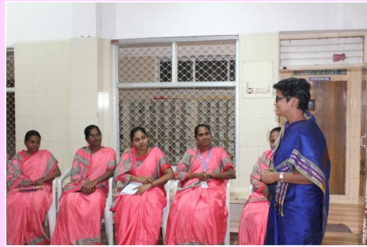
SSSVV HUDDLE WORKSHOP