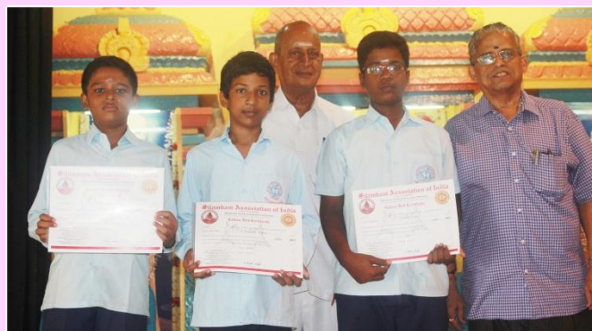
STUDENTS WHO RECEIVED GRADE BELTS IN SILAMBAM