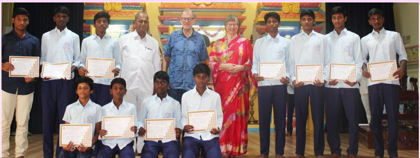
PARTICIPANTS OF THE CBSE CLUSTER LEVEL KHO-KHO TOURNAMENT