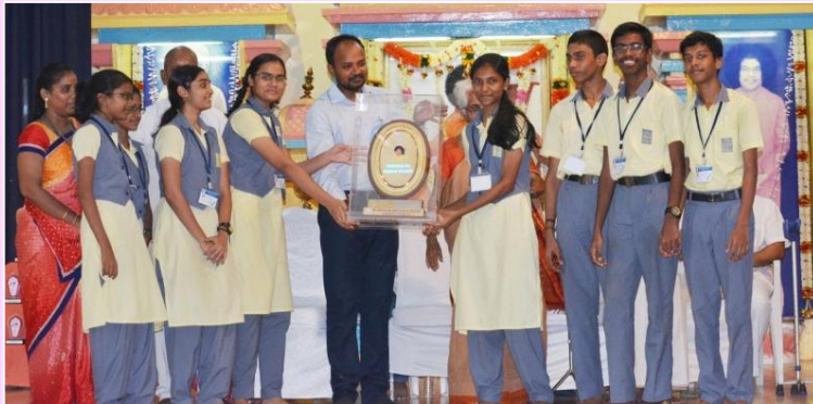
SWADHYAYA 16 TH SEMINAR ON HUMAN VALUES