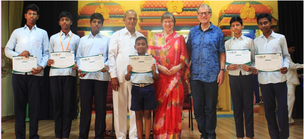
PARTICIPANTS OF THE DISTRICT LEVEL CHESS TOURNAMENT