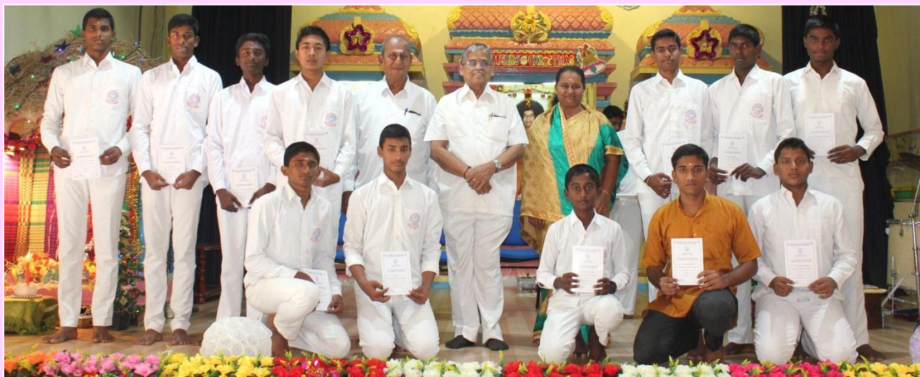
PARTICIPANTS OF THE SEETHAKATHI INTER-SCHOOL VOLLEYBALL TOURNAMENT