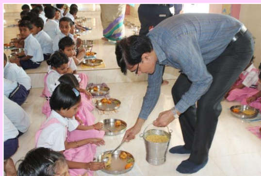
NITHYA NARAYANA SEVA