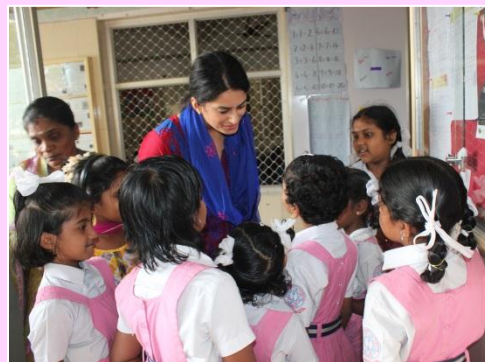
FREE EDUCATION TO ALL