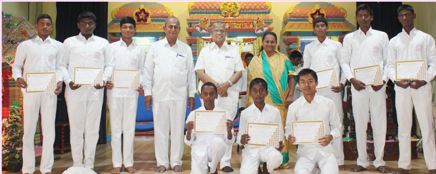
CBSE ATHLETIC EVENT PARTICIPANTS