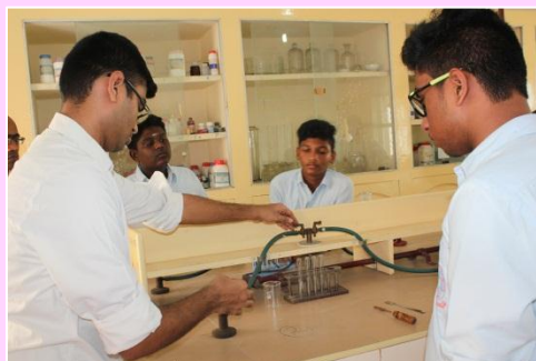
SSSVV VOLUNTEERS TRAINING THE STUDENTS IN THE CHEMISTRY LAB