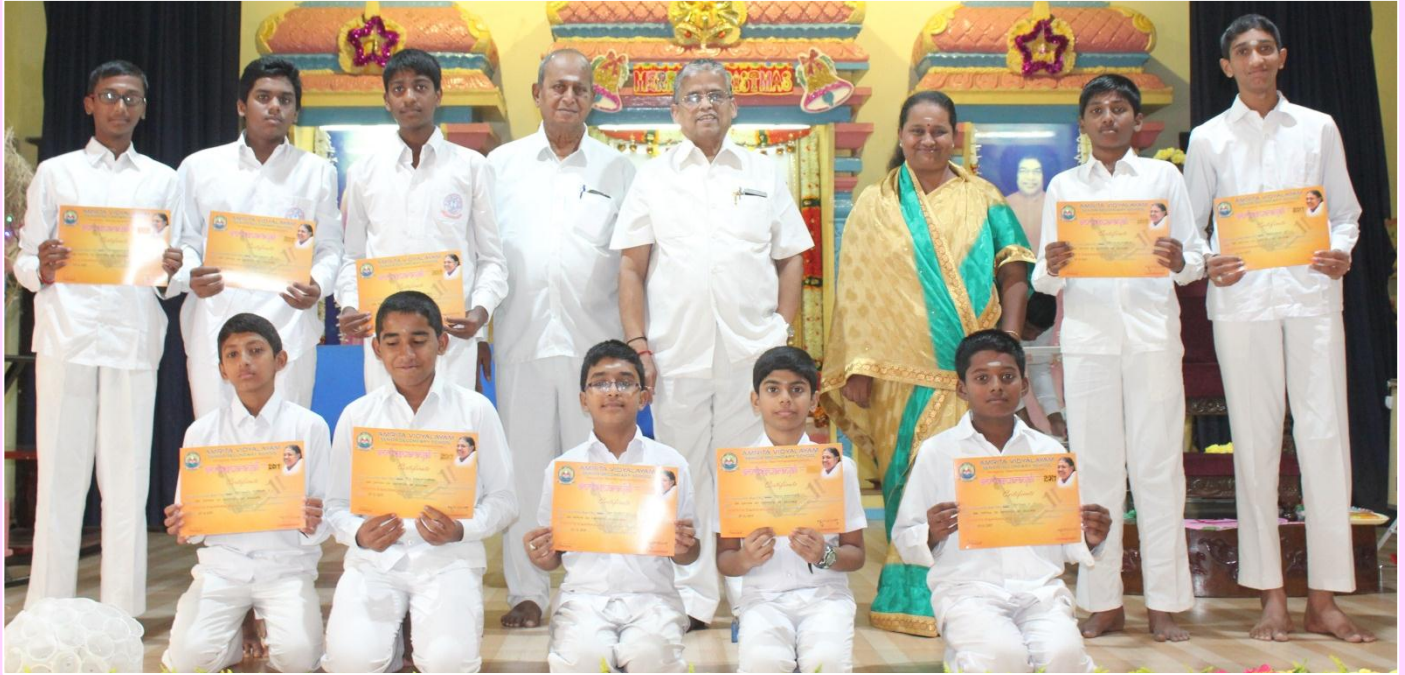
AMRITHA SWARANJALI BHAJAN SINGING PARTICIPANTS