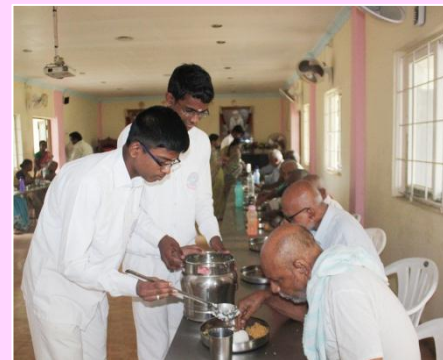
STUDENTS INTERACTING AND SERVING FOOD TO THE GRANDPAS AND GRANDMAS