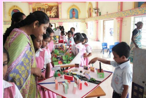
STUDENTS DEMONSTRATING SCIENCE EXPERIMENTS THROUGH MODELS PREPARED BY THEM