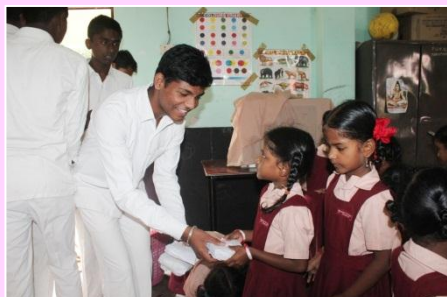
STUDENTS DISTRIBUTING FOOD PACKETS