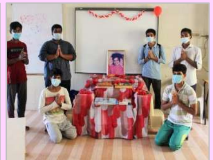
NAVARATHRI SADHANAS – GLIMPSES