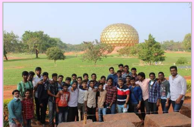
At Sri Matru Mandir, Auroville