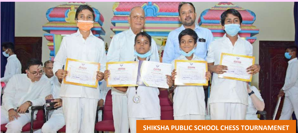
SHIKSHA PUBLIC SCHOOL CHESS TOURNAMENET