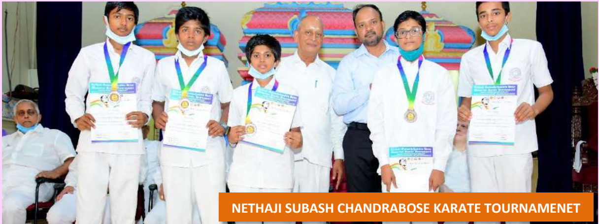
NETHAJI SUBASH CHANDRABOSE KARATE TOURNAMENET