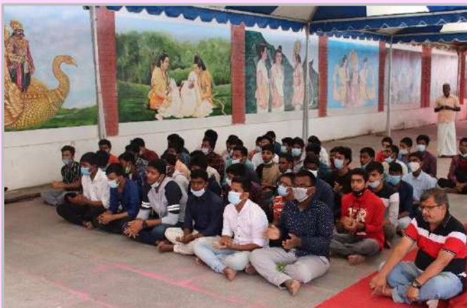
Students offering Hanuman Chalisa at Panchavati Sri Hanuman temple

The Botanical garden at Auroville enlightened the students about different varieties of medicinal plants, orchids etc. The guide at the botanical garden explained the usefulness and specialty of the varieties of plants and trees present. It was followed by visit to the Matru Mandir . All the students performed meditation in front of the temple and felt peace inside. Finally, students relished their time at the Pondichery beach. The trip planned and completed few days before the third lockdown announced by the Govt. witnessed the Grace and love of Bhagawan on His dear students.