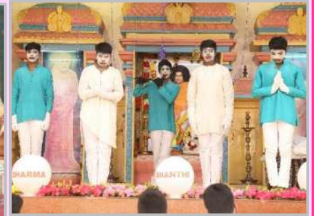
FINAL DAY CELEBRATIONS OF SWAMI'S 96 TH BIRTHDAY