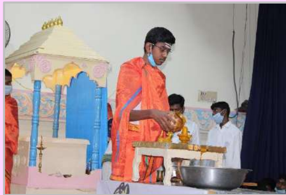
STUDENTS PARTICIPATING IN THE MAHASHIVARATRI CELEBRATIONS