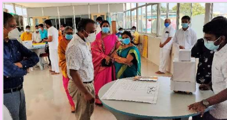
GUESTS WITNESSING THE MODEL PROJECTS EXPLAINED BY THE STUDENTS