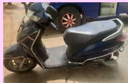
NEW VEHICLES ARRANGEMENT FOR HOSTEL