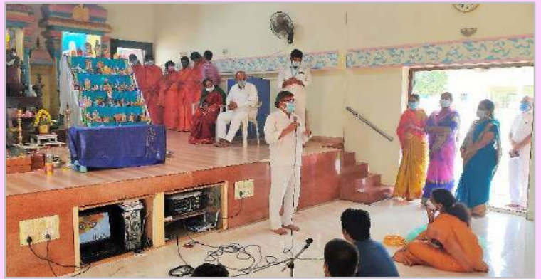
SPECIAL HOMAM PERFORMED ON VIJAYA DASASMI – SSSIE'S BIRTH ANNIVERSARY