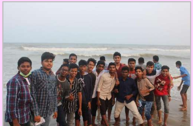
At Pondicherry Beach