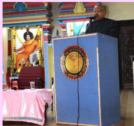
HONOURABLE JUSTICE SRI KARPAGA VINAYAGAM INTERACTING WITH THE STUDENTS