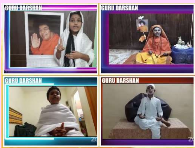
GURU DARSHAN ENACTING THE GURUS OF INDIA