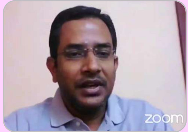
ONLINE CULTURAL PRESENTATION