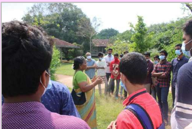
At Botanical Garden, Auroville