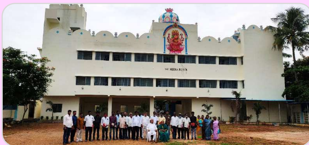
SAIMEERA BLOCK DURING GRIHA PRAVESHAM FUNCTION