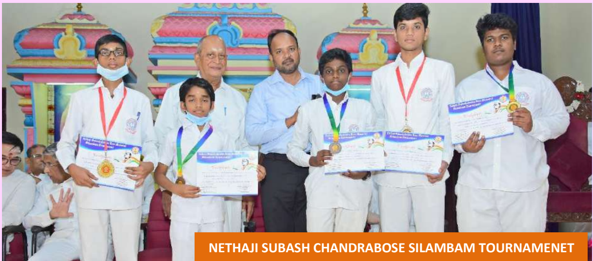
NETHAJI SUBASH CHANDRABOSE SILAMBAM TOURNAMENET