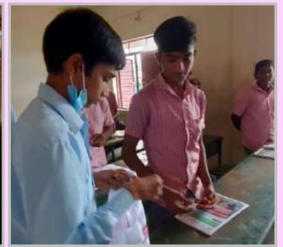
GRAMA SEVA – OLD AGE HOME AND GOVT. SCHOOL VISIT